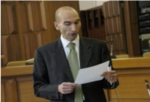
Speech by a magistrate: "Witnesses, in spite of ourselves". URL: https://trucioli.it/2013/01/31/intervento-di-un-magistrato-testimoni-nostro-malgrado/ (access: 27.07.2022).